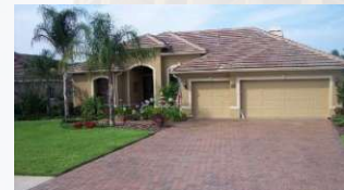
Renovations & Painting

Building Plastering Paving Plumbing Water proofing Painting Damp proofing Roof painting Tilling Skimming Special wall coatings Rhinolite Renovation of building Dry walls All roof repairs Flashing Big projects. And other related projects.